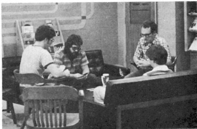
The noon bridge game in the AIChE student chapter lounge is a department fixture.